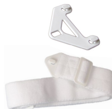
25mm – SB25

***With 4-point belt lug connection when used with a belt support plate.