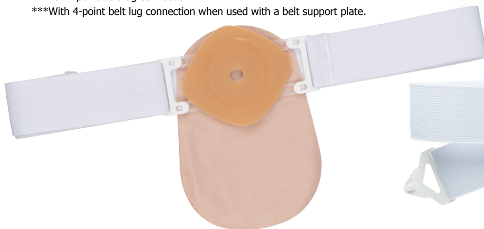
50mm – SB52